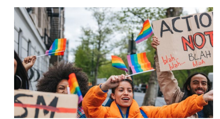
Supporting the LGBTQIA+ community: Tips for being an ally.

In the fast-paced, interconnected world we live in today, it's easy to get caught up in the negative news cycle. But what if we took a step back, slowed down, and focused on making our corner of the world a better place?