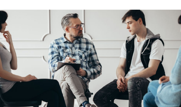
Overcoming Anxiety (Podcast)