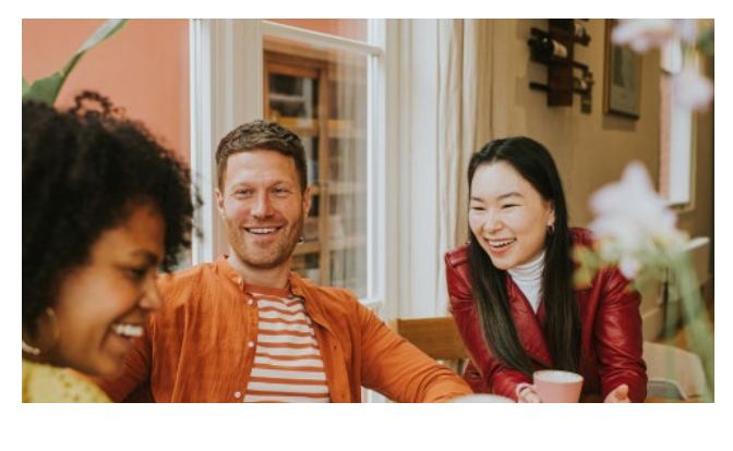
You do not have to win the lottery to enjoy life.