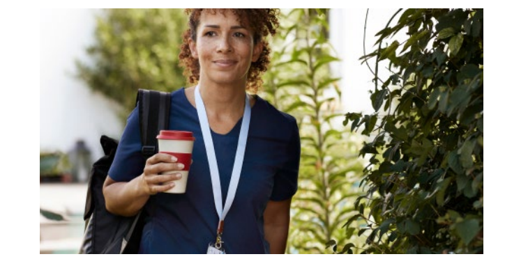
How to develop an optimistic outlook.

Optimistic people tend to believe that good things happen more often than bad things. They may face many challenges, but their positive thoughts help them cope when they have setbacks.